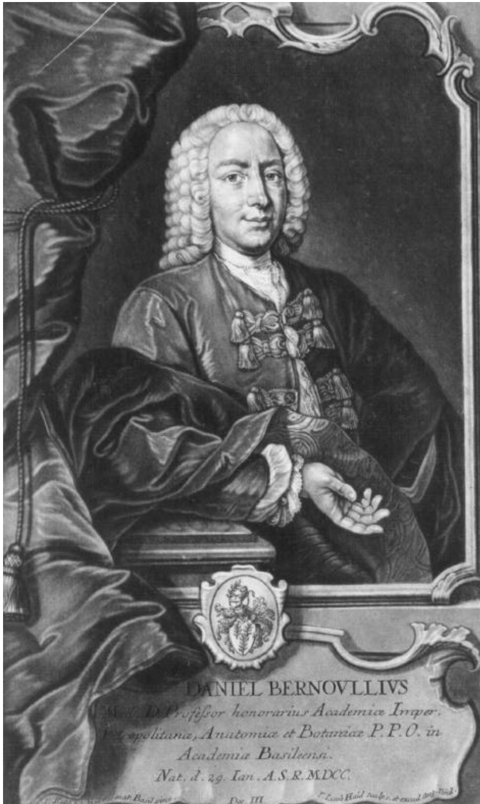
Figure 1. The portrait of Daniel Bernoulli aged 44 honouring his status as Professor of Anatomy and Botany in the medical faculty at Basel.